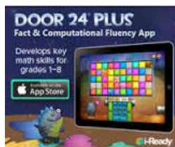
Door 24 Plus

For extra math and vocabulary practice, try our FREE Apps, available from the iTunes store.